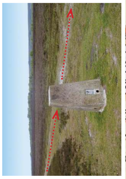
Trig point is a surveying point on high ground: a land surveyor's reference point on high ground, usually marked by a stone pillar set into the ground