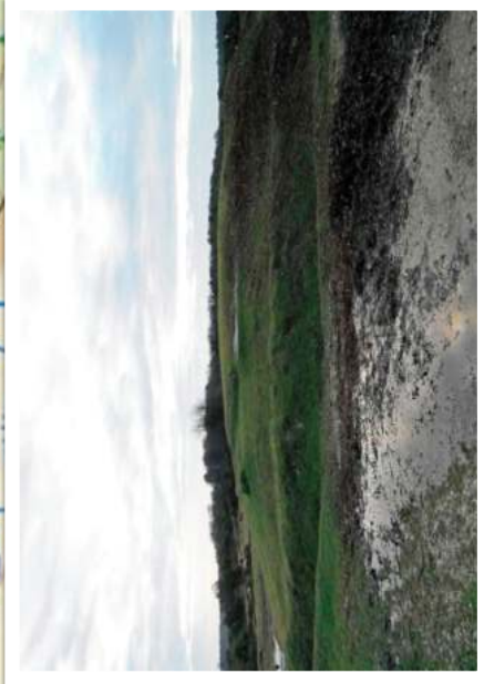
The central control mound of Yew Tree Heath Heavy AA Battery as it is today.