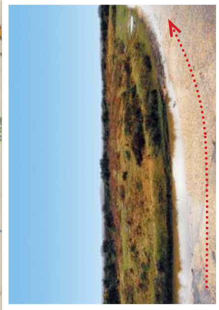
One of the earth mounds covering one of the gun pits at Yew Tree Heath Heavy AA Battery as it is today.